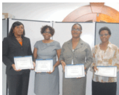
Trainees with certificates

"I know the participants have learnt a lot during the programme and will carry that information with them to the various Attorneys General Chambers, and make this programme well-known to other perspective participants in the Caribbean," she stated.