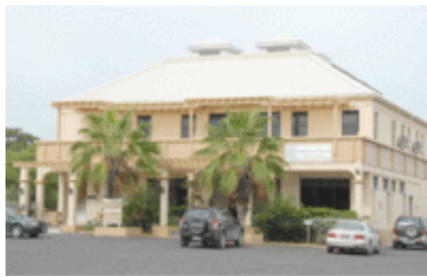
Hannah-Waver House accommodates Law Centre

After much preparation and publicity over the years, the Regional Law Revision Centre Inc, has at last come to fruition in Anguilla with the official opening arranged for Friday, September 28 at 4.00 p.m. Included in the ceremonial programme has been an address by Anguilla's Chief Mnister, Osbourne Fleming, and the cutting of the ribbon by him along with other officials from the UK, Montserrat and the Turks and Caicos Islands.